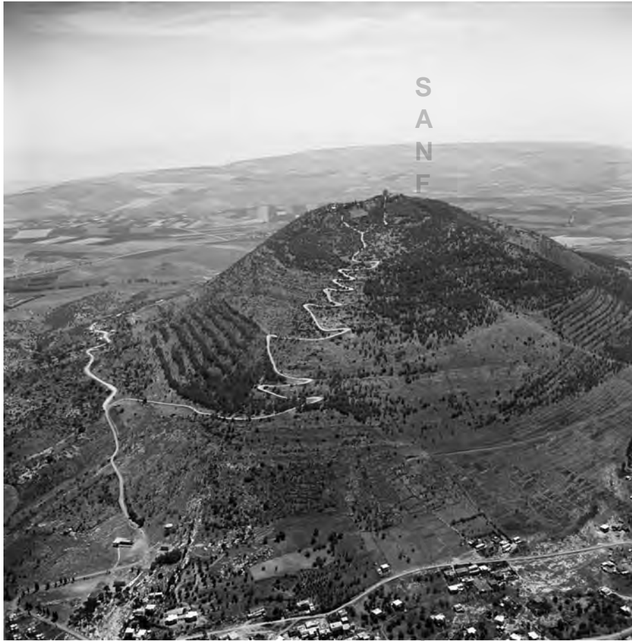
FIGURE 5-2 In Judges 4:6, Deborah sends Barak to prepare his army on Mount Tabor. This photograph shows Mount Tabor today.

The Canaanites, equipped with heavy war chariots (4:3), were drawn up on the level plain, while the ill-equipped Israelites were on the slopes of Mount Tabor. A heavy storm broke. The Kishon River, usually no more than a trickle of water, became a raging torrent. It flooded the plain and turned it into a muddy swamp. The heavy iron chariots, so fearsome on solid ground, became liabilities instead of assets. The Israelites rushed down the mountain and cut the enemy to pieces (4:13–16; 5:19–21).