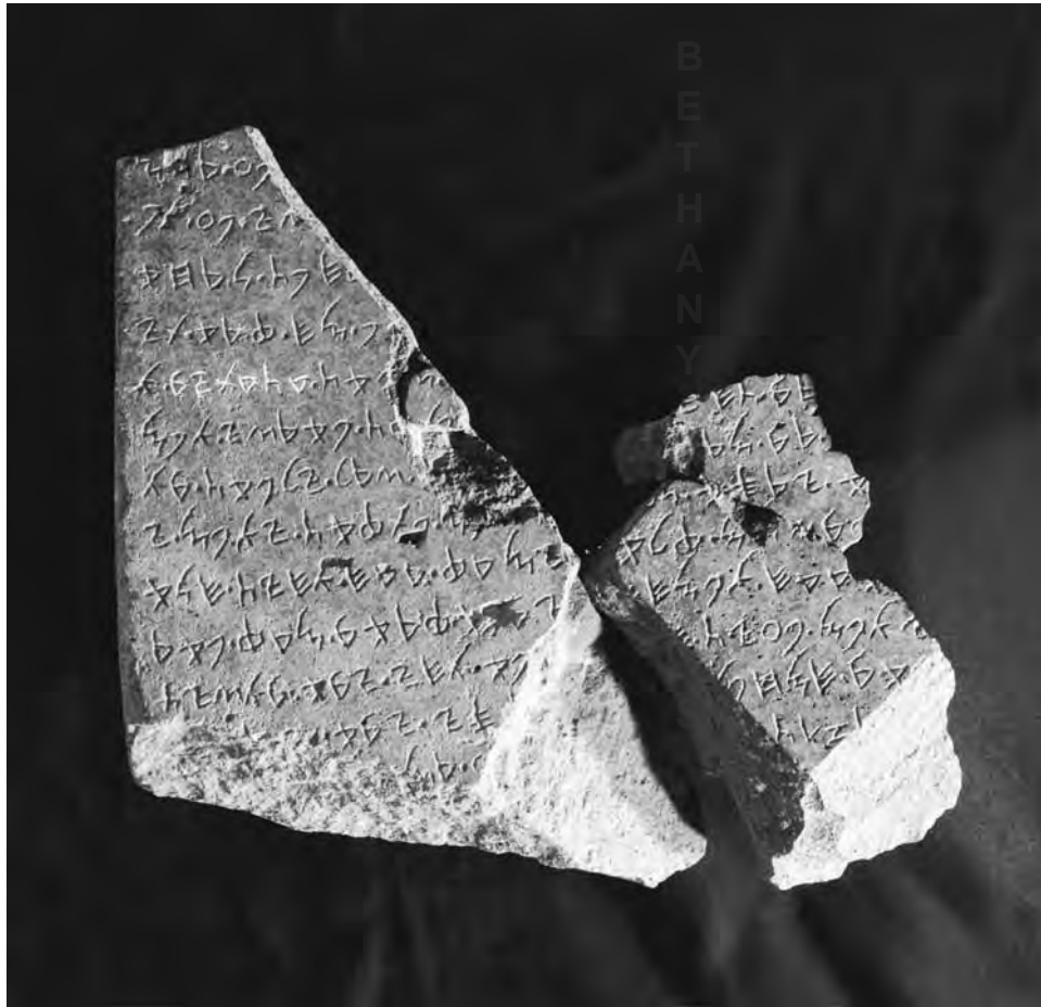
FIGURE 6-3 This inscription, found at Tell Dan in northern Israel, was part of a victory stele or column erected by an Aramean (Syrian) ruler to brag about his success in a battle against the house of David.

He ruled his kingdom well. One reason for this may have been that, when he captured Jerusalem, he captured people who had been trained in Egypt to run the government. Instead of killing them, he put them to work organizing and running his empire. 12