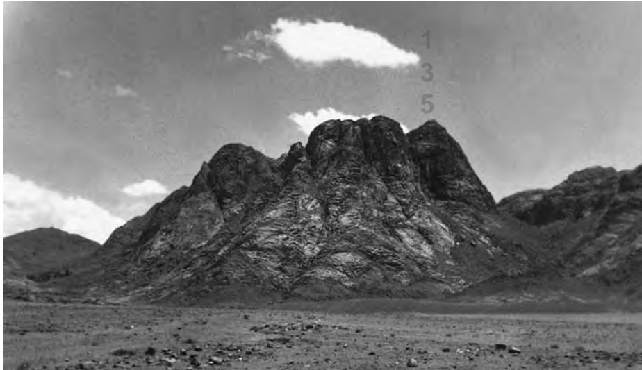
FIGURE 4-3 “On the third new moon after the Israelites had gone out of . . . Egypt . . . they came into the wilderness of Sinai” (Exod. 19:1). Jebel Musa, the traditional site of Mount Sinai, is located in this range of mountains.