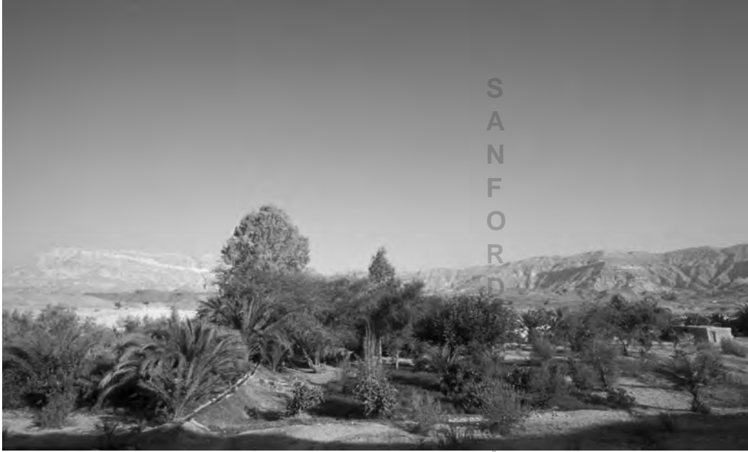
FIGURE 4-4 Exodus 15:27 reports the arrival of the Israelites at an oasis called Elim. This photograph shows a modern oasis in the Sinai region of Egypt.

this famous prophet, but others did also. We now know of Balaam apart from the biblical text through inscriptions that have been found in Transjordan. That this is the same prophet spoken of in Numbers 22–24 is shown by the fact that he is identified in these inscriptions as “Balaam, the son of Beor” (cf. Num. 22:5). The inscriptions also speak of him receiving his oracles at night, as in Numbers 22:8, 19f. Unlike in the Bible, however, he is further described as “seer of the gods,” who speak to him at night. This would indicate that he was by no means an Israelite prophet or a follower of YHWH (the LORD). There is mention also of goddesses, another idea foreign to Israelite religion. As in the biblical account, he is pictured as one who pronounces curses. 24 It is in light of these texts, then, that the Balaam stories in Numbers will be examined.