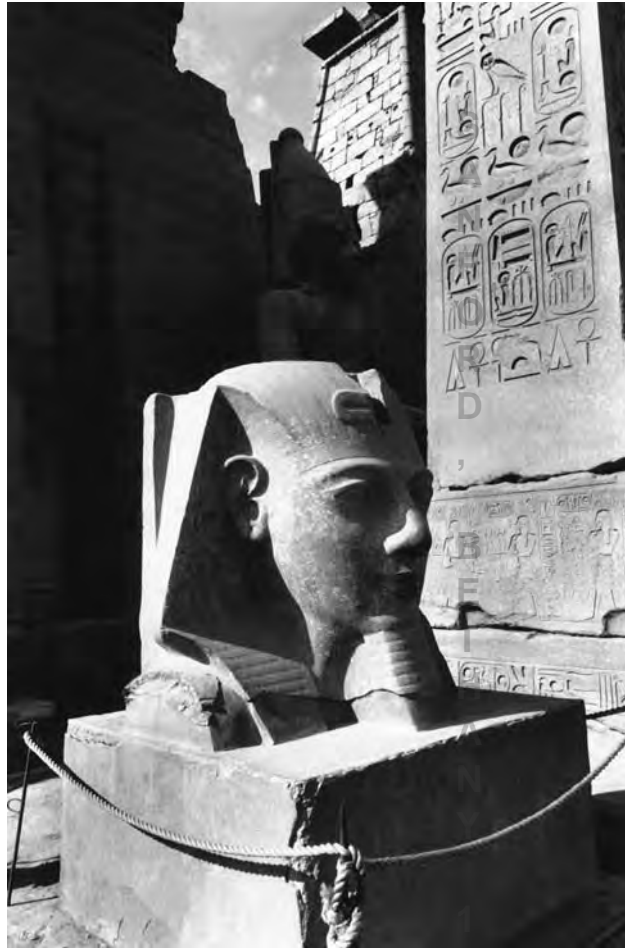
FIGURE 4-1 “The Pharaoh said to (Moses), ‘Get away from me . . . do not see my face again’” (Exod. 10:28). This statue is a representation of Ramses II, believed to be the Pharaoh of the Exodus.