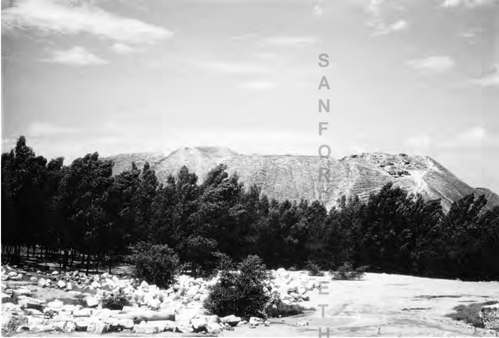
FIGURE 6-2 “They put [Saul’s] armor in the temple of Astarte, and they fastened his body to the wall of Beth-Shan” (1 Sam. 31:10). Tell Beth-Shan, in the valley of Jezreel, was the site of an ancient city that guarded an important crossing of the Jordan.

on them, some of his men did not want to share any of the spoils of battle with those who had stayed behind to guard the camp. David ruled that every man should receive an equal share. Furthermore, he shared the spoils with the elders of Judah (30:7–31).