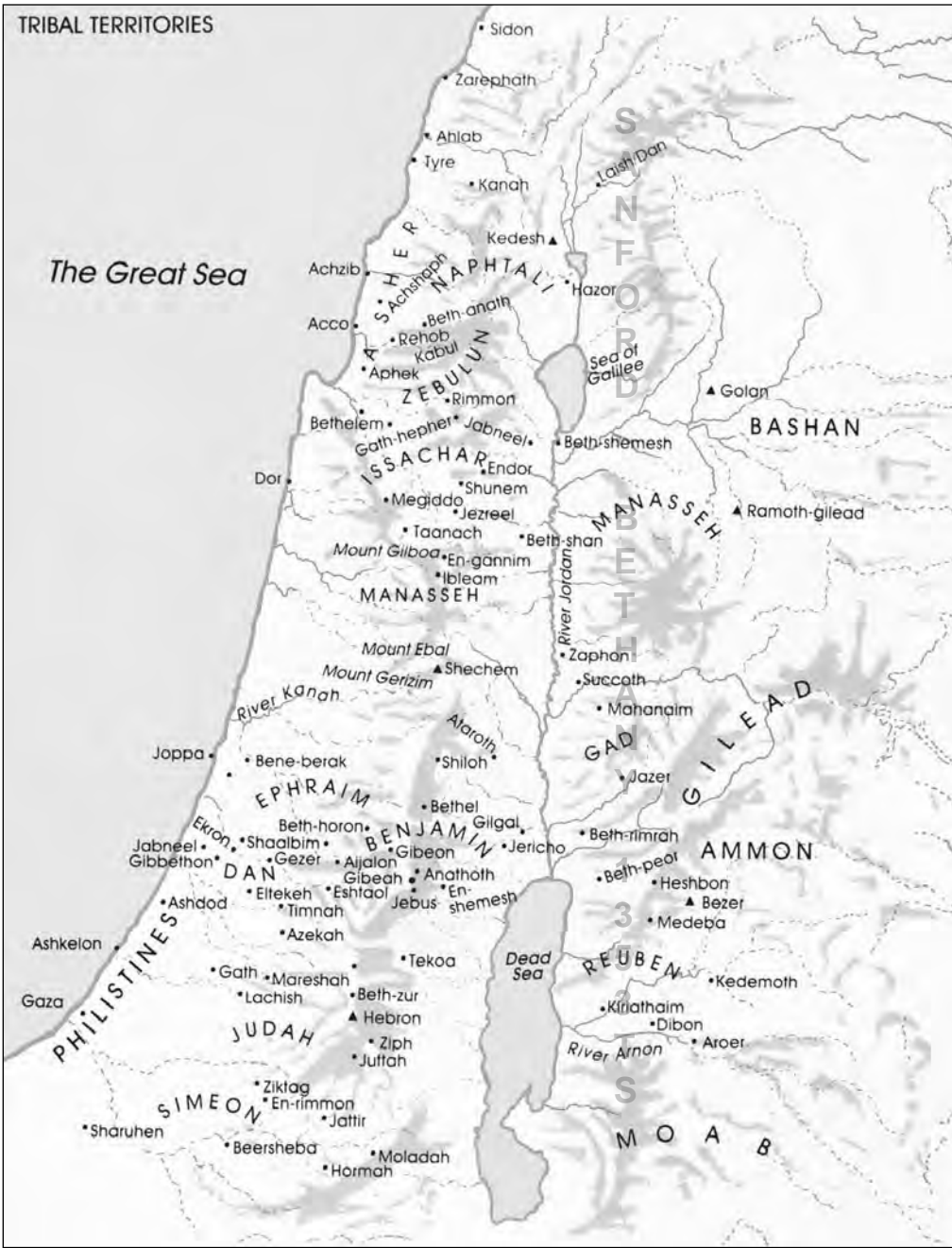
FIGURE 5-1 The division of the land (Josh. 13:1–19:51).