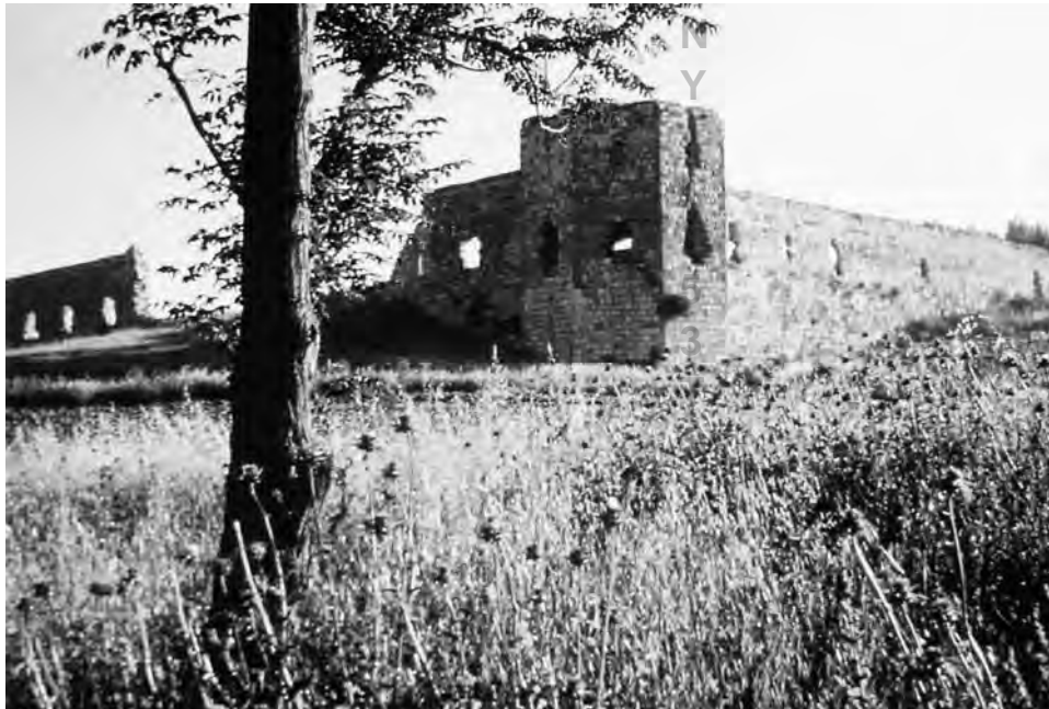
FIGURE 6–1 “[The Israelites] encamped at Ebenezer, and the Philistines encamped at Aphek” (1 Sam. 4:1d). Aphek was a strategic point on the great coastal highway. The remains of a sixteenth-century Turkish fort now occupy much of the site.

The result was a disaster for Israel. The Philistines were inspired to fight harder. Not only did they defeat the Israelites, but they killed Hophni and Phineas and captured the Ark (4:6–11).