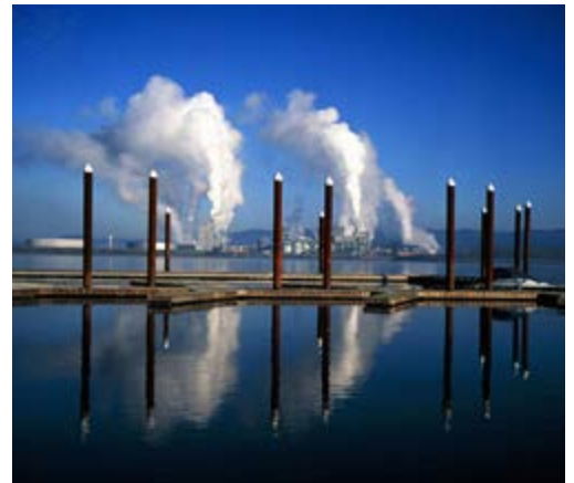
Industrial Area 2