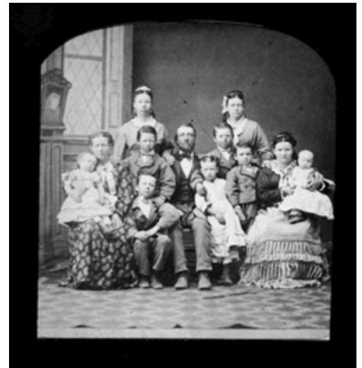
Polygamous Family with Multiple Wives 11

In the United States, monogamy is the only legal form of marriage. Monogamy refers to a marriage that consists of only two people. Prior to recent changes in marriage laws, this meant one man and one woman. Although same sex couples can now legally marry and some marriage laws have changed, it must still be a monogamous marriage. Polygamy [Video, 7:14 mins] is sometimes allowed in other countries, though typically in non-Western cultures and often dependent upon religious practices. This can occur as either polygyny (one man with multiple wives) or polyandry (one wife with multiple husbands). Polyamory is also gaining popularity in the United States. This is a relationship that includes multiple people that are all involved in romantic relationships with each of the members. These relationships can include both sexes, married and unmarried individuals.