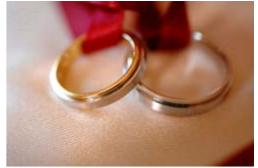
Wedding Rings 10

race, ethnicity, religion and social class. Most societies are endogamous, which means they are encouraged or required to marry within the group. Fewer are exogamous, which means they are encouraged to marry outside the group. Cultures that enforce endogamy may have anti-miscegenation laws which make it illegal to marry outside the group. Until the late 1960s, many states made it illegal for Blacks and Whites to marry, for example. You also likely practice propinquity, though perhaps less so than your parents. This is the practice of marrying someone within your geographical proximity. Isn't it lucky for romantic love that soul mates always live in the same town? The internet and online dating services have reduced the practice of propinquity in this generation.