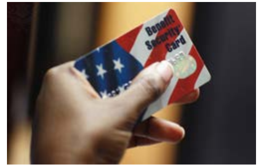
Food Stamp Card 5

The study of political economy [Video, 3:00 mins] looks at the relationship between the state and the market, the role of political authority in affecting the processes of production and distribution. This necessarily encompasses the role of each in all aspects of exchange – labor, capital, technology and trade. For example, while the US economy is based on a free market and production for profit, the US also provides social services and support for its citizens through the redistributive spending of tax dollars by the national and state governments. This includes “free” K-12 education, Pell Grants for college, Food Stamps and TANF payments for poor families and Medicaid. While most US companies are privately owned, the state provides tax incentives, grants and subsidies as well as tariffs on foreign goods, all of which benefit domestic producers at the expense of consumers and foreign producers. These are often known as corporate welfare [Video, 1:21 mins]. Most Americans are vocal about welfare payments to the poor, but few realize that more of their tax dollars are spent on corporate welfare. Political Economy examines the layers of these interactions.