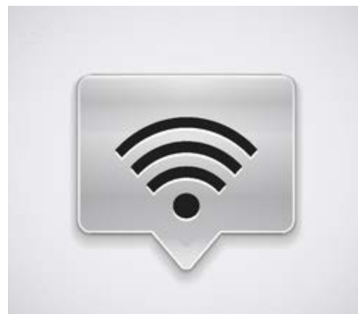
WiFi Map Locater 3