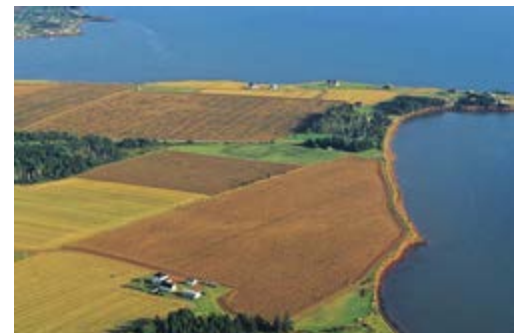
Aerial View of Large Farm 6

As societies grew, work and the division of labor began to shift. Agricultural work was the early focus of labor in pre-industrial societies. Once beyond subsistence farming for survival, this involved collective farming, either as a family, a community or a group. Early communities grew what they needed for sustenance. The labor was hard and the hours were long. Imagine if you had to grow and harvest the cotton, turn it into thread and weave it into fabric every time you needed a new shirt? How would your life be different if you had to bake bread every day instead of walking to your corner market? Industrial work was the first shift in labor, and it grew out of industrializing agriculture (e.g., the cotton gin ). Industrial work is labor associated with the production of manufactured goods. As power came from hydroelectric and then steam engines and factories grew, the need for industrial laborers grew as well. Marx argued that this industrial work led to the alienation of man to self and others. Workers began to sell their labor, rather than labor for their sustenance alone. At the end of the day, they did not own the product of their labor, merely a wage from it with which they had to buy material things and food. This caused, per Marx, a psychological disconnect from self and others. You became only as important and valued as your wage. As mentioned earlier, post-industrial work focuses on services and “knowledge” work.