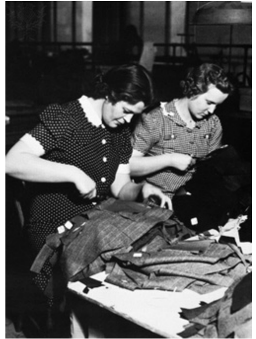
Garment Factory Workers 1

In module 5 you learned about politics, education and religion, three important social institutions. The economy and family are two other very important social institutions that are essential for social functioning. Most sociologists argue that the family is the most important social institution. In module 6 you will learn how the economy and family have evolved and developed over time. You will learn about the challenges that each institution faces as it changes and how these challenges affect society at large. You will learn theoretical approaches to understanding how and why these institutions function and dysfunction as they do in the social order.