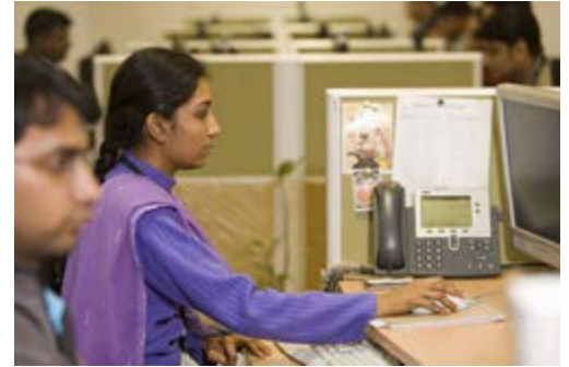
Globalization of Labor Market 7