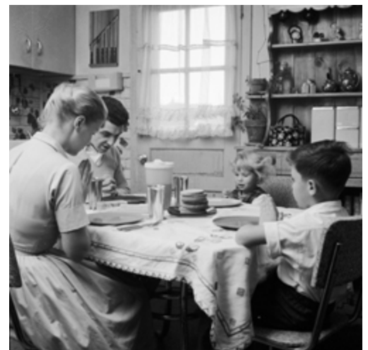
Traditional White Family 8

As mentioned earlier, changes in the economy led to changes in the family. The definition of family is a group that is related by marriage, adoption or blood. Early families were almost always nuclear families whose work and life surrounded their agricultural tending to a plot of shared land. The rise of industrial practices and urbanization both undermined the traditional rural agricultural family type. A nuclear family [Video, 3:42 mins], also referred to as the traditional family, includes a husband, wife and their biological or adopted children. Traditional family life included having the nuclear family surrounded by the extended family; grandparents, aunts, uncles and cousins. This tight network of family relationships resulted in stability and support for the children within the nuclear family. The modern family has undergone many changes. It has been extended to include same sex parent families, blended families, single parent families and cohabitating parents. Sociologists now discuss the new